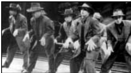
The Gentlemen of Japan flaunt their talents in the Alliance Theatre Company production of Hot Mikado .

The opera's international success was marked by countless artists determined to reinvent THE MIKADO in their own image, and its overwhelming popularity prevented D'Oyly Carte from stifling every production that diverged from the norm. His company, however, played it in the conventional man-