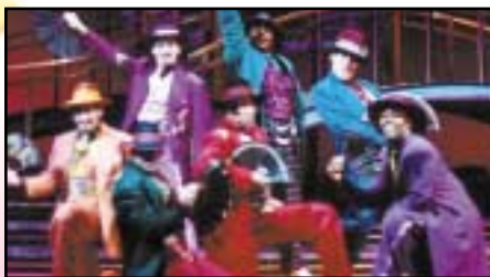
The Gentlemen of Japan from the American Musical Theatre of San Jose's production of Hot Mikado .

In spite of Gilberts' "inspiration", there were other factors that contributed to the genesis of the project. London had been undergoing some cultural diffusion. Japan had only been open to the West since 1853, but by 1884 London was, as were other parts of Europe, enamored of the Orient, fascinated by its novelty. A group of Japanese immigrants had settled in Knightsbridge, not a mile from Gilbert's home in South Kensington, establishing a village there where visitors could see a