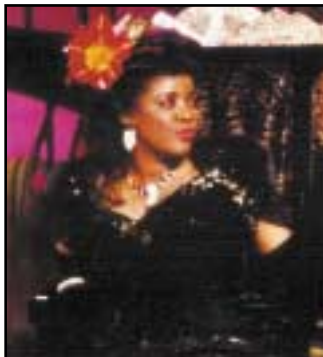
Katisha in the Ford's Theatre production of Hot Mikado.

Since its first production on March 14, 1885, at the theatre built explicitly for Gilbert & Sullivan's operas – the Savoy in London – THE MIKADO has had a long, intense and unusual career. The long story of this perennial favorite reads almost like a biography, it is so filled with personality – a constantly changing personality that acquires the characteristics of many periods, the styles of many fashions. It is a tribute to Gilbert's genius for creating shrewd plots and insanely ridiculous librettos and Sullivan's equally clever melodies that makes THE MIKADO at once so enduring and so flexible. It has been the subject of numerous adaptations over the years, HOT MIKADO only the most recent. But before we embark on the HOT MIKADO journey, it may be worth knowing some of the back-story.