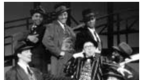
The Gentlemen of Japan and Koko from the Ford's Theatre production.

as HOT MIKADO in 1986, then moved to Chicago's Marriott Lincolnshire Theatre. The production transferred in 1995 to London's West End.