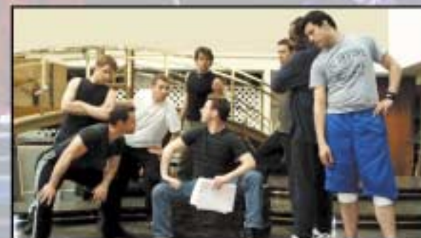
Rehearsal for the Musical Theatre West production of HOT MIKADO .