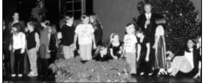
Children love the tradition of coming up on stage during the holiday show.

Santa himself! Call the Box Office today at 562 856-1999 ex 4 to order your seats, or you may order them at the table in the lobby. It's a holiday present the entire family will enjoy, and a perfect opportunity for a company party! ■