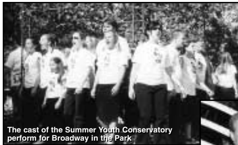
The cast of the Summer Youth Conservatory perform for Broadway in the Park

The cul-de-sac was turned into a festive Central Park with twinkle lit trees surrounding the tables and gazebo. Hors d'oeuvres were provided by Legends with The Grand catering the dinner and the Blue Pacific Swing Orchestra providing the music. Over 200 silent auction items were displayed on tables lining the streets.