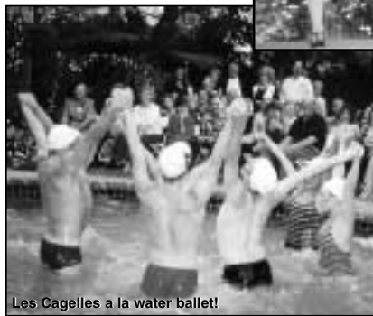
Les Cagelles a la water ballet!