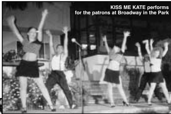
KISS ME KATE performs for the patrons at Broadway in the Park