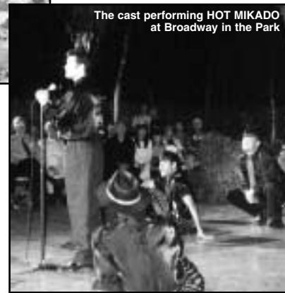
The cast performing HOT MIKADO at Broadway in the Park