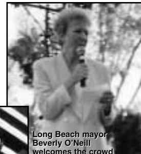
Long Beach mayor Beverly O'Neill welcomes the crowd

A special thank you to the following Broadway Belles/Music Men whose table sponsorships helped underwrite the